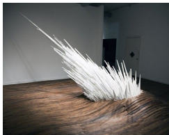
Figure: A scheme of this flavor

From the case where S is the spectrum of a rank one aic valuation ring, some small arguments extend the result first to the case where S is the spectrum of any aic valuation ring, and then to the case where S is qcqs and all connected components of S are spectra of aic valuation rings . Such schemes are far from Noetherian, but in other ways they are not so bad. The spectrum of an aic valuation ring is basically a “spike”, so a scheme like this is some profinite collection of spikes.