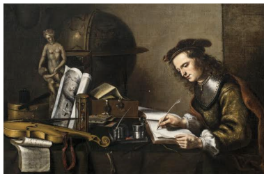
Figure: The creation of étale cohomology

In talking to graduate students, I've noticed a common misconception that étale cohomology is a “dead” / “static” / “ancient” subject, with nothing left to be done.